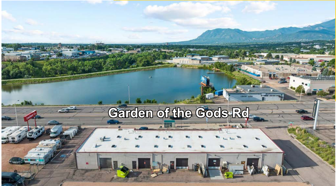
Garden of the Gods Rd

140 East Garden of the Gods Rd, Colorado Springs, CO 80907